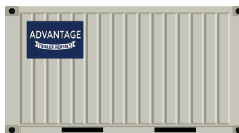
20' GROUND LEVEL STORAGE CONTAINER